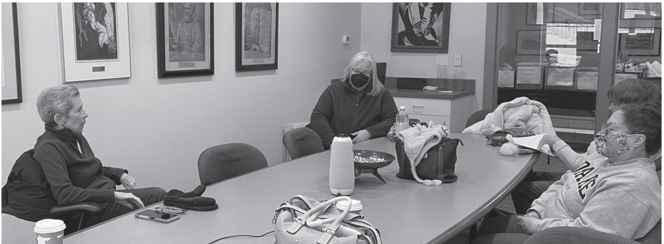
Below: Sisterhood January Schmooze