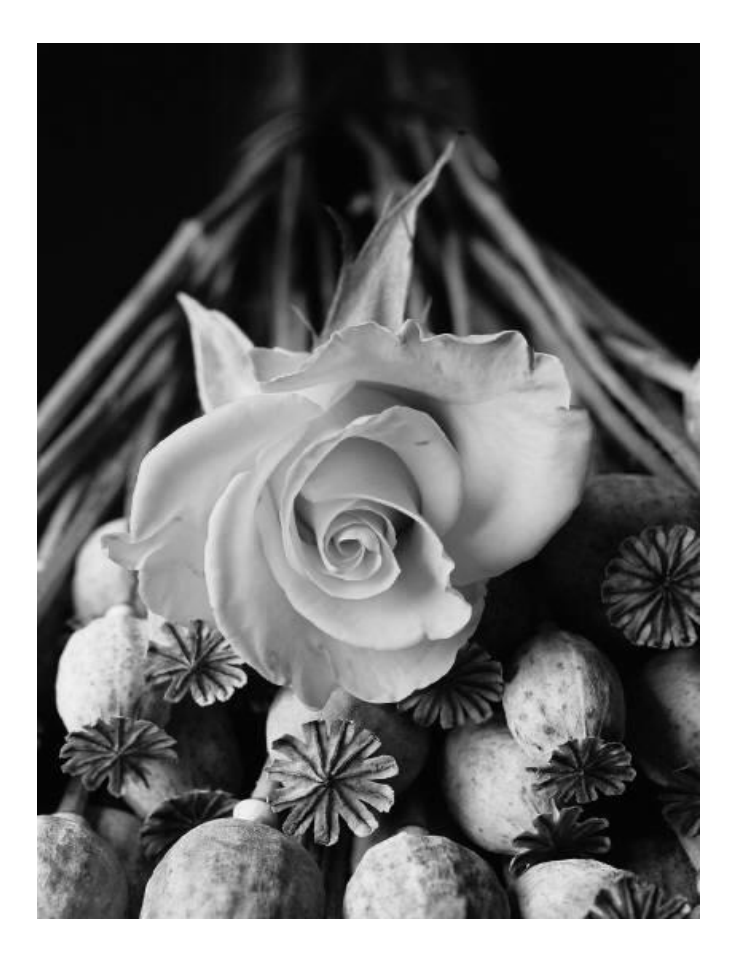
Sustaining Life, Embracing Death

Let us bless the well Eternally giving The circle of life Ever dying, ever living.