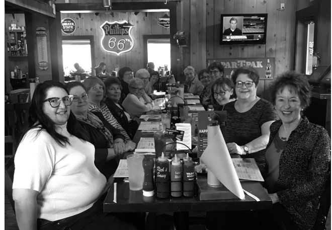
Gathering for lunch at Famous Dave's in June

Each of us is the hope the world needs – though our action seems small – it counts. Like Rice Krispie Bars! One Rice Krispie isn't much or especially tasty, but