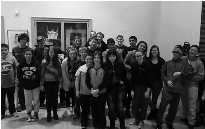
Youth Group Game and Movie Night at the Temple on January 24