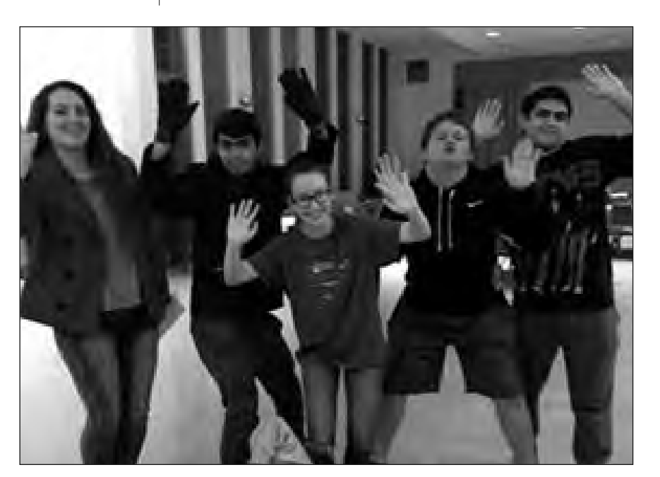
Got to love our Youth Group Board. Always fun!